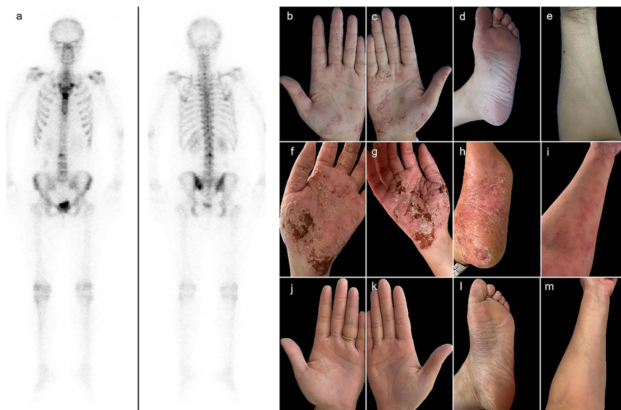
Figure 1 (a) Inflammatory changes and the “bull’s head” sign in ^{99m}\text{Tc} -methylene diphosphonate whole-body bone scintigraphy. (b–m) Cutaneous manifestations. Erythema, pustules, and desquamation on the palms (b and c) and the left sole (d) at baseline. No apparent lesions on the left upper extremity (e) at baseline. Severe pustules and crusts on the palms (f and g) and the left sole (h) during the administration of adalimumab. Erythema on the left upper extremity (i) during the administration of adalimumab. Slight desquamation on the palms (j and k) and the left sole (l) after treatment with secukinumab. Scattered desquamation on the left upper extremity (m) after treatment with secukinumab.

Following a definitive diagnosis, we administered adalimumab (80 mg for the first week, followed by 40 mg after a week and 40 mg every 2 weeks thereafter). Initially, the PPP and joint pain improved after three injections. However, cutaneous lesions worsened and developed psoriasiform rash after 26 days (Figure 1f–i). Therefore, we added adalimumab (80 mg every 2 weeks) and minocycline (100 mg, twice daily). However, lesions remained unmanaged after 28 days. As a result, methylprednisolone pills (16 mg, daily) were administered; however, pustules still gradually increased, and the maximal PPPASI was 21 points. After 42 days, adalimumab, minocycline, and methylprednisolone were discontinued, and the patient was administered secukinumab (started with 300 mg weekly over 5 weeks, followed by 300 mg every 4 weeks). After treatment with secukinumab, significant improvement in PPP and paradoxical psoriasis were observed, and the patient did not